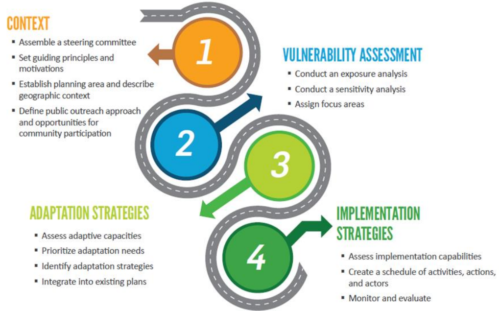
Figure 1. Communities can follow this roadmap of steps to create an adaptation plan.