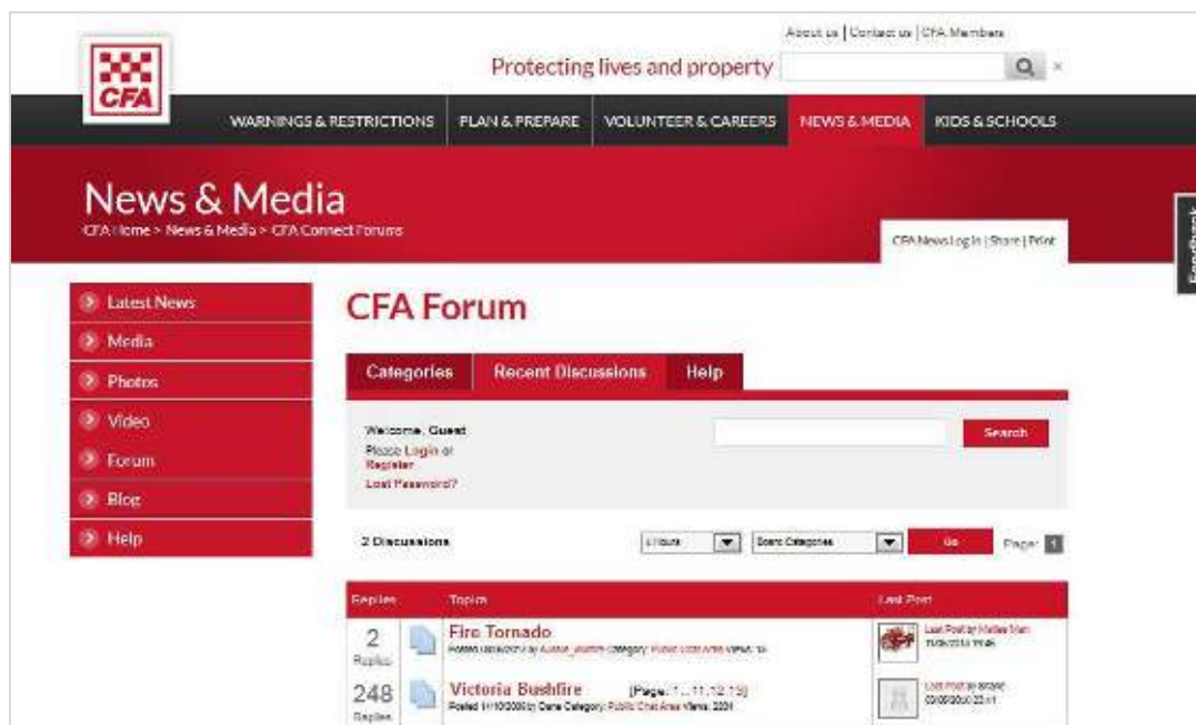
Figure 4-1. CFA News & Media Screenshot

The 2009 bushfires in Victoria, Australia, revealed a critical need to manage information flow between emergency management agencies and the community in a more dynamic manner. CFA, which provides firefighting and other emergency services to rural areas and regional townships in the state of Victoria, Australia, did extensive work to update their emergency communications strategies as a result of the bushfires. Currently, CFA uses a variety of social media platforms such as Facebook and Twitter, but also encourages the public to engage and upload content to its CFA News & Media website. The website provides news, multimedia content, and a community discussion board called the CFA Forum, which is shown in Figure 4-1.