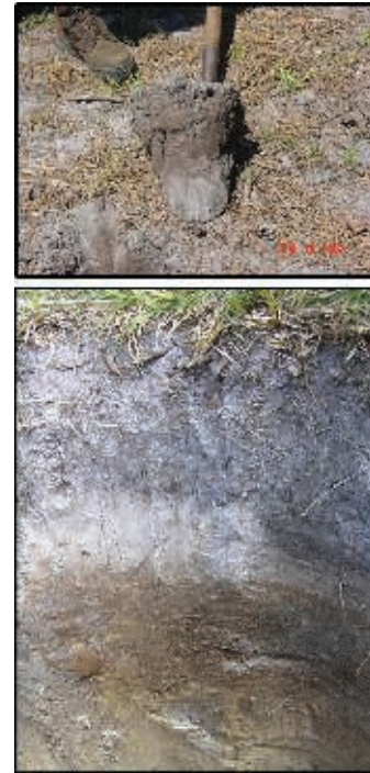
Figure 2. Typical soil pit profile collected in a bahiagrass pasture in South Florida. While the majority of the roots tend to concentrate in the top 4- to 8-inches depth, they can also occur at deeper soil depths. Soil carbon concentration is typically greater at the surface (4–6" depth) where carbon inputs (via root and aboveground biomass) are more abundant.

et al. 2001), hence it can be readily transferred into more permanent storage in the soil. Because carbon stored below ground is more permanent than plant biomass, soil carbon sequestration in grazing lands provides a long-term alternative to mitigate atmospheric greenhouse gas emissions.