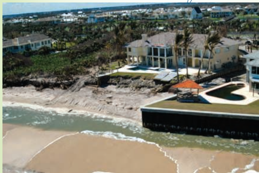
FIGURE 1: Sea Walls (Dothan, Alabama)

The sea wall on the right reflects wave energy and exacerbates erosion on the adjacent properties.