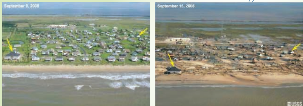
FIGURE 4: Shoreline Before and After Hurricane Ike (Galveston, Texas)

These photos show the movement of the vegetative line before and after Hurricane Ike.