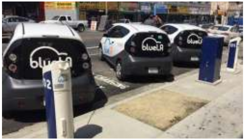
BlueLA Charging Stations and Electric Vehicles

Low-income communities and communities of color are disproportionately burdened by climate change and greenhouse gas emissions, as these communities frequently live near busy roads and freeways, where they face exposure to dangerous levels of emissions. Often, individuals in these communities suffer from higher rates of asthma, cancer, and other pollution-related illnesses.<sup>22</sup> Many cities are working to ensure that as they advance their GHG emission reduction and zero emission mobility goals, they target, prioritize, and protect the most impacted residents.