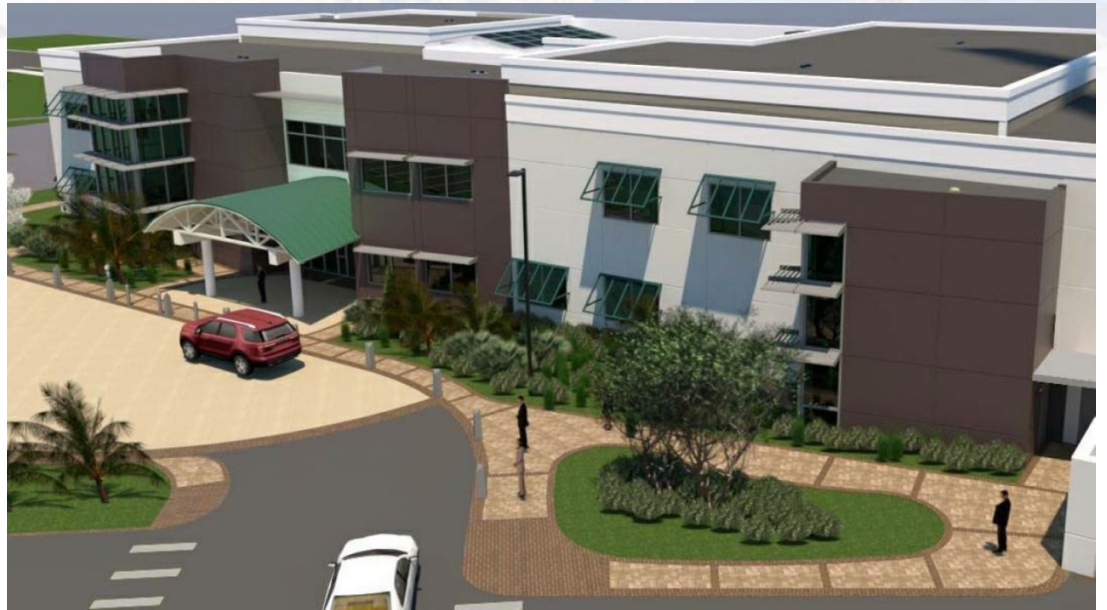
Artist's Rendering of New Courthouse